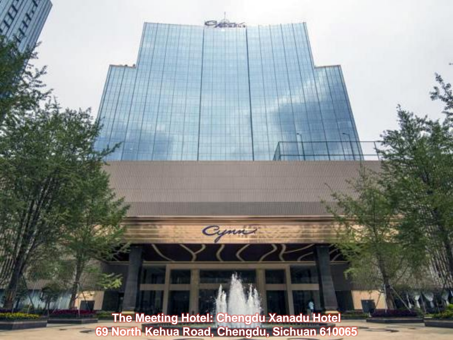
The Meeting Hotel: Chengdu Xanadu Hotel 69 North Kehua Road, Chengdu, Sichuan 610065