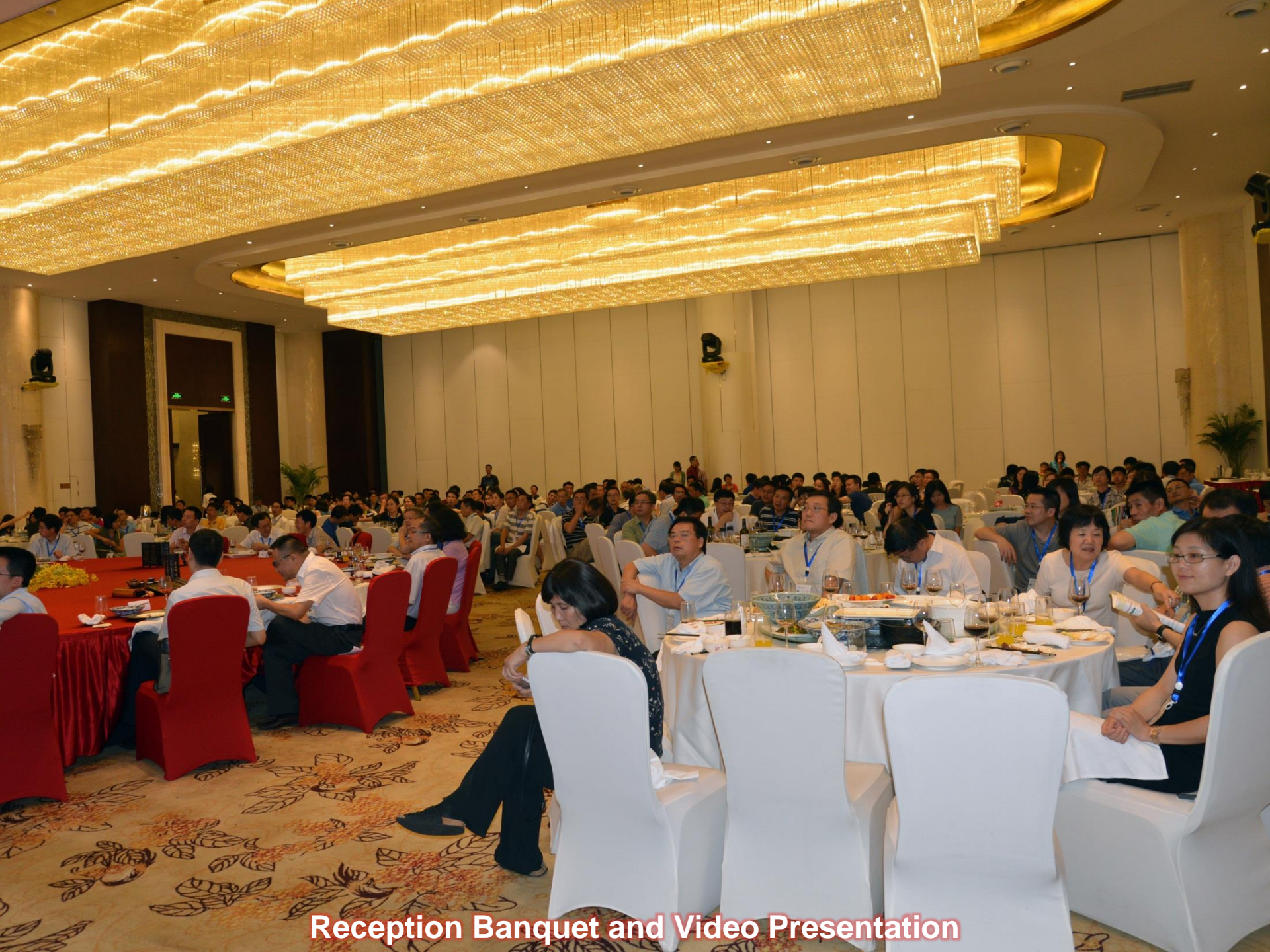
Reception Banquet and Video Presentation