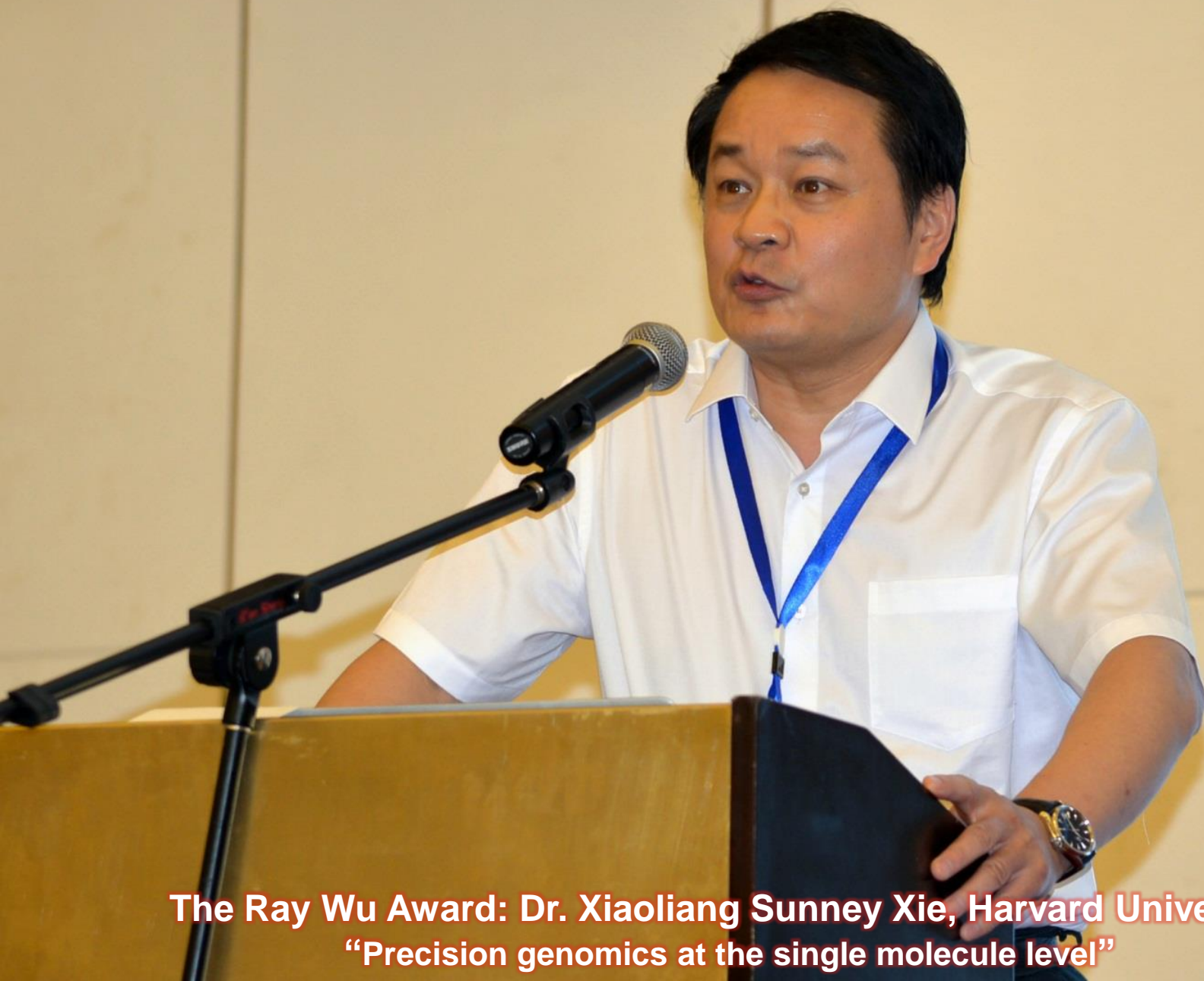
The Ray Wu Award: Dr. Xiaoliang Sunney Xie, Harvard University “Precision genomics at the single molecule level”